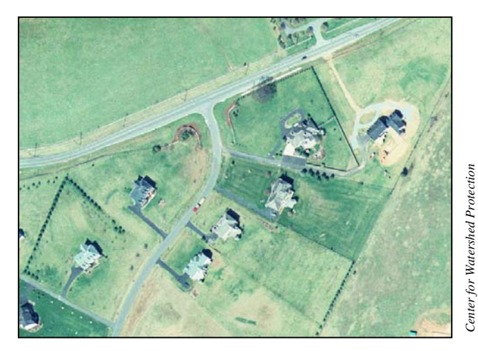
Urban lawns present significant opportunities for reforestation. They account for 66% of turf area.